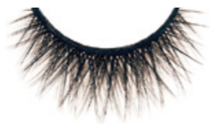
THE X EFFECT