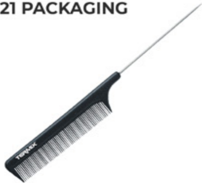
TITANIUM TERMIX COMB 821 PACKAGING