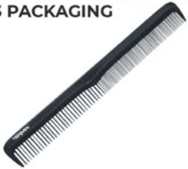
TITANIUM TERMIX COMB 823 PACKAGING