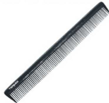
TITANIUM TERMIX COMB 819 PACKAGING