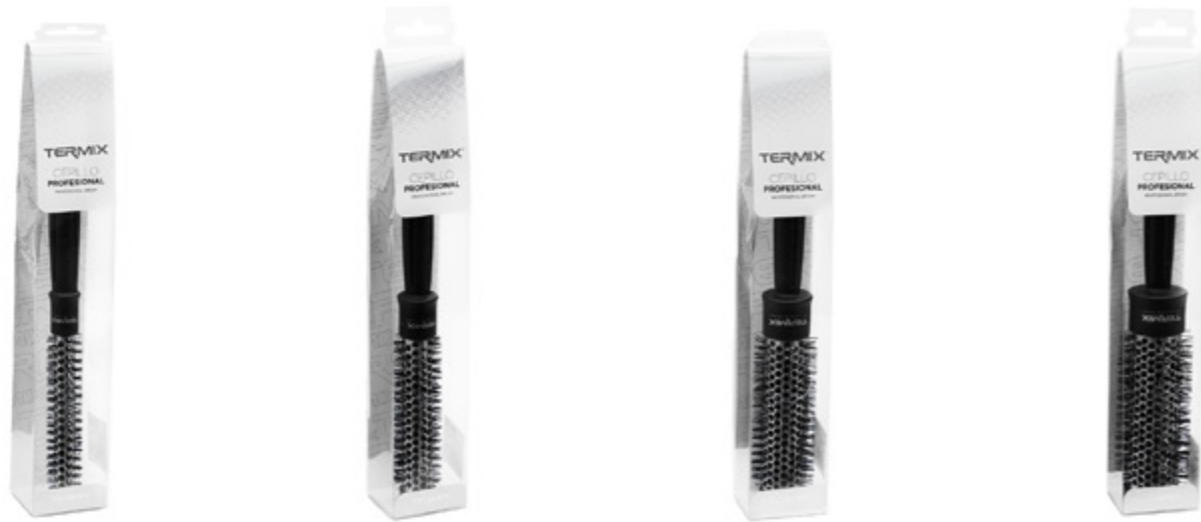
PROFESIONAL O12 PROFESIONAL O17 PROFESIONAL O23 PROFESIONAL O28

The Termix professional range has been inspired by those who envision hair as a sign of identity. Manufactured with high quality nylon fibers and a modern ergonomic design, they are perfect for creating all types of hairstyles, elevating creativity to its maximum potential Brushs Sizes 12mm,17mm,23mm,28mm,32mm,37mm,43mm,60mm