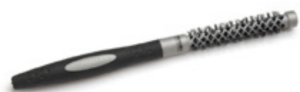
12 TX EVOLUTION BASIC BRUSH PACKING