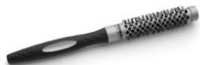
17 TX EVOLUTION BASIC BRUSH PACKING