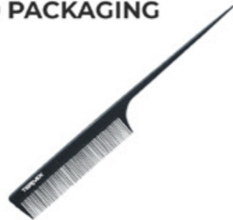
TITANIUM TERMIX COMB 860 PACKAGING