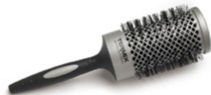
60 TX EVOLUTION BASIC BRUSH PACKING