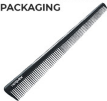
TITANIUM TERMIX COMB 807 PACKAGING