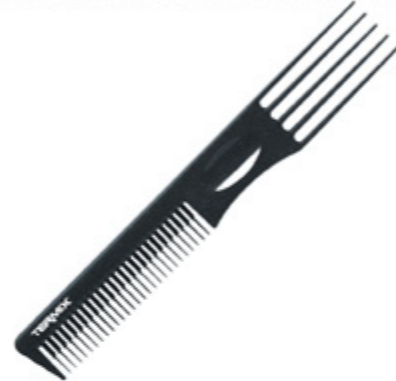
TITANIUM TERMIX COMB 876 PACKAGING