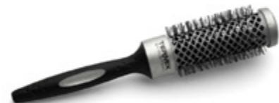
28 TX EVOLUTION BASIC BRUSH PACKING