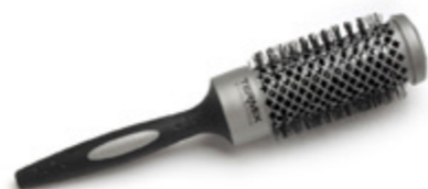
37 TX EVOLUTION BASIC BRUSH PACKING