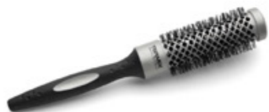
32 TX EVOLUTION BASIC BRUSH PACKING