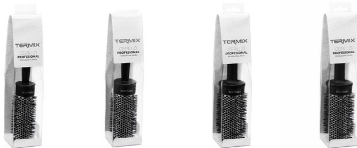
PROFESIONAL O32 PROFESIONAL O37 PROFESIONAL O43 PROFESIONAL O60