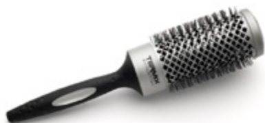
43 TX EVOLUTION BASIC BRUSH PACKING