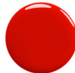
POP MY BERRY