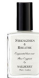
STRENGTHEN & BREATHE OXYGENATED BASE COAT AND NAIL STRENGTH- ENER