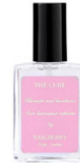
THE CURE NAIL HARDENER