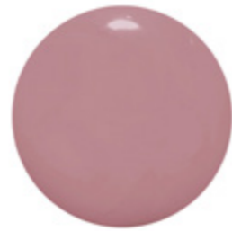
LOVE ME TENDER