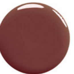
DIAL M FOR MAROON