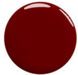
LE TEMPS DES CERISES