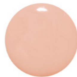
A TOUCH OF POWDER