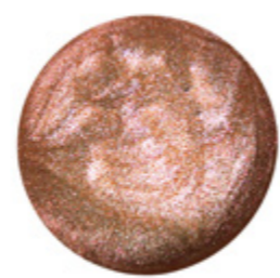
RING A POSIE