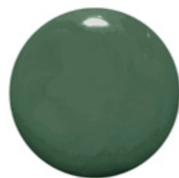
VIVA LA VEGAN