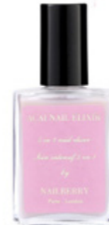
ACAI NAIL ELIXIR