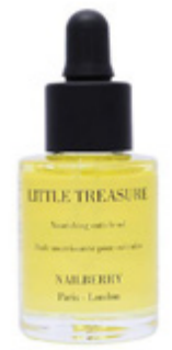
Little Treasure Cuticle Oil