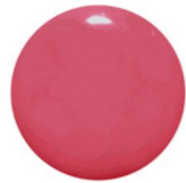
A SMART COOKIE