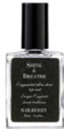
SHINE & BREATHE OXYGENATED TOP COAT