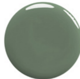
LOVE YOU VERY MATCHA